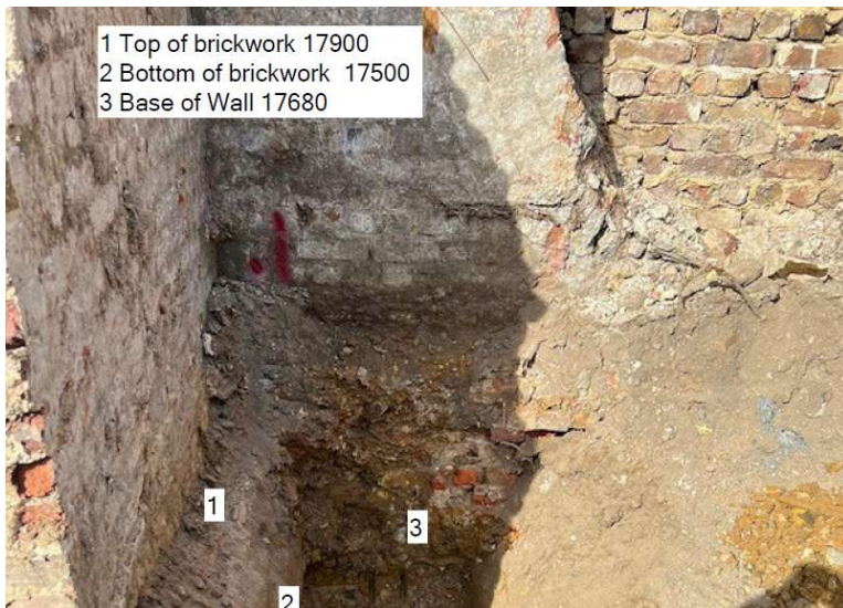
Photograph 2 – Level of the Existing Footing under the South Wall of the Crypt

The level of the foundations was confirmed to be at 17.480 after carefully exposing the existing footings.