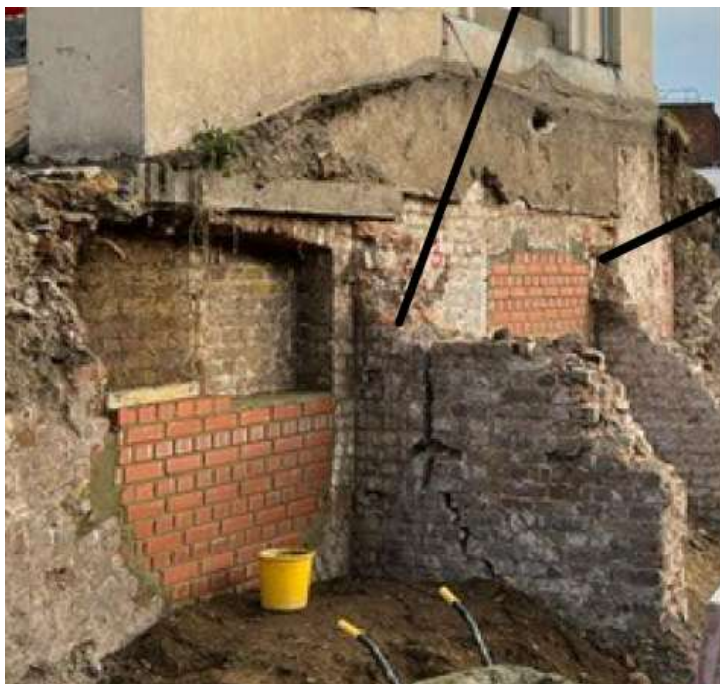
Photograph 3 – Remedial Works at the South of the Colonade

The site findings confirmed that the footings in the area are above the structural slab level in the area next to the lift of the proposed building which is 17.335 and that underpinning will be required for the area. For the underpinning to be done in safe and effective manner the full width of the wall has to be underpinning. Considering the load paths and the structural integrity we have specified that the exposed arches should be bricked to the full width of the prior to any underpinning. This will ensure that the loads are transferred to the footings and the new underpin without relying on old arch. At the top of the new and the existing masonry infill well rammed drypack should be appropriately installed. Please refer to the photograph below with the work in progress from site.