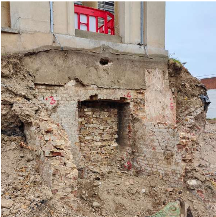
Photograph 1 – Site findings at the South of the Crypt/Colonnade

As part of the agreed sequence the south wall of the crypt was exposed externally, and the foundations depth and type were exposed/confirmed. It was also noted that there is an existing arch which has been previously infilled with masonry internally. The thickness of the infill does not match the thickness of the wall and at the top there are gaps between the masonry arch and the infill wall next to it. Please refer to the photograph below